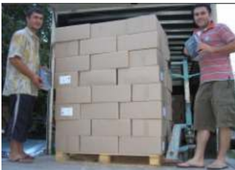
Today we have opportunity to ship pallets of Bibles into Moldavia. No more smuggling!