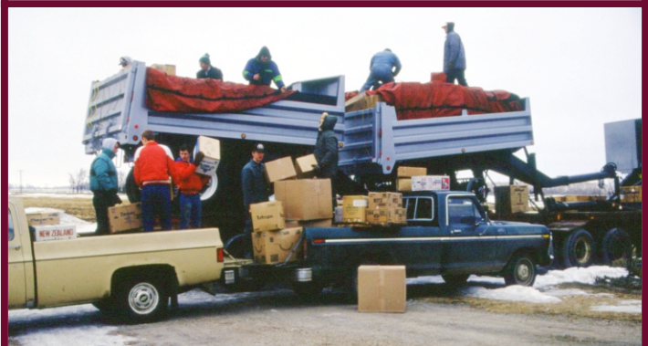
Load #000, the first load for Faith Mission being loaded South of Winkler MB on a cold blowy day back in the early 90s. What was thought to be the last load because "surely southern MB wouldn't have that much used clothing".

Load #292 we were able to meet in Tuchapy, UA. And looking at our clothing bins and storage areas we are far from out of clothes. At our current pace we will be shipping load number 300 later this year. PTL