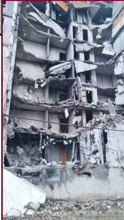
Vitaliy, pictured below, and his wife and daughter lived in this apartment until it was destroyed Feb. 24, 2022.