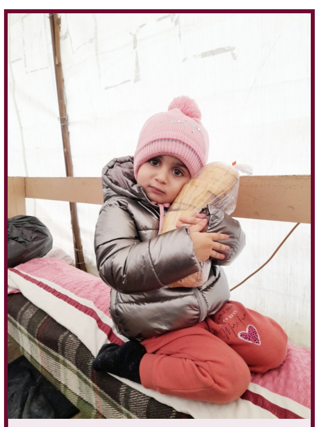
December 2, 2023 a group of believers visited Trans-Carpathia Ukraine from Chernivtsi, to minister to a group of Gypsies. They brought them the Word of God as well as physical nourishment.