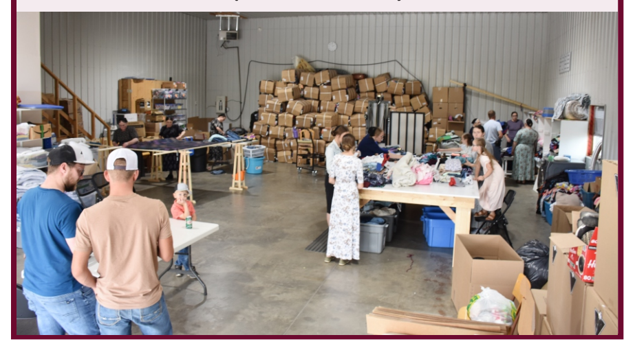
Photo taken at a recent Open House that was held in Grassy Lake at our warehouse at 605 1st North. Although space is tight there now and it seems it is always time to haul a load of bales to Winkler we have plans in place to purchase and renovate this building to enable us to ship containers directly from AB.

of operations in Grassy Lake from 3 to 5 members. This is an exciting time of growth and we ask for your prayers that the right decisions can be made and that everything will continue to grow and that this facility can continue becoming a key part of Faith Mission.