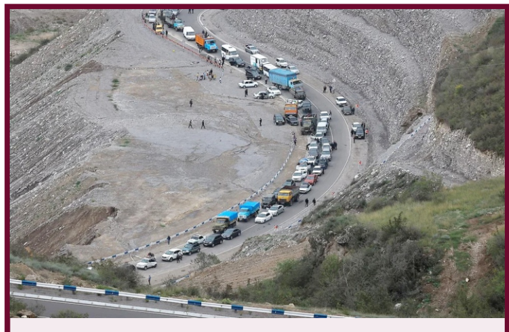
Citizens of Nagorno-Karabakh packed up whatever possessions they could and fled from their war-torn hometowns