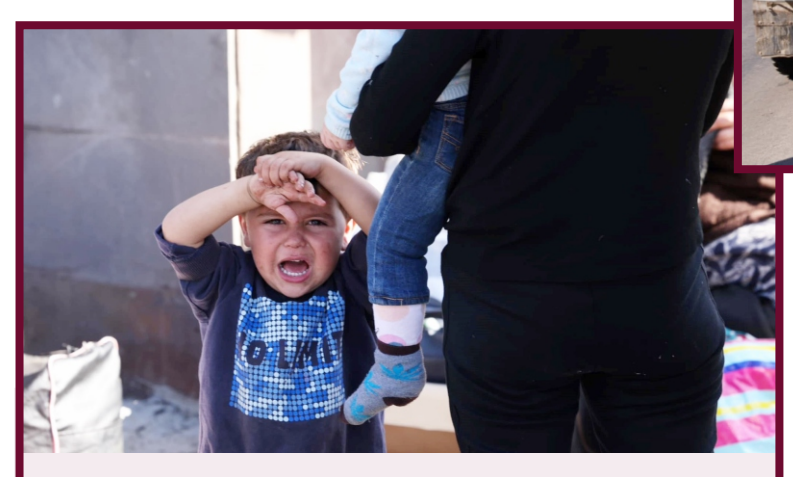
Especially the children, suffer lifelong fear instilled in them by the terrrors of war

People who are still suffering the consequences of the Spitak earthquake are experiencing an additional hardship. The earthquake with the magnitude of 6.9 on the Richter scale occurred on December 7th, 1988 and ruined the houses of about 1,000,000 people. In addition to this massive amount of property destroyed, 25,000 people also died because of the earthquake. 35 years have passed since then and hardly anyone in Europe remembers this