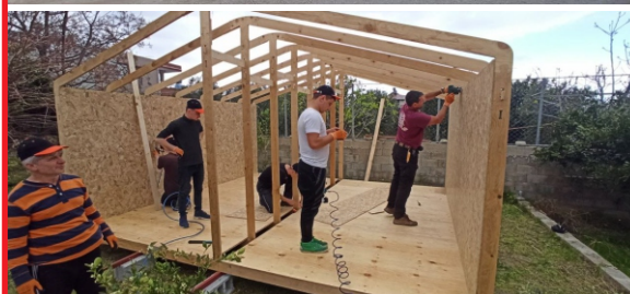
An outreach team of fellow believers from Bulgaria and Moldova is building emergency shelters in the Hatay area.

children in the area is also planned soon, because the schools are cancelled and the children are sitting in the rubble. As bad as this natural disaster is, it still offers great opportunities to bring the gospel of Jesus Christ to the people there.