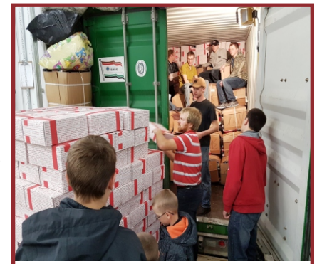
Loading gifts into the container destined for Ukraine

* Here is a list of items that we recommend you put into a gift box: